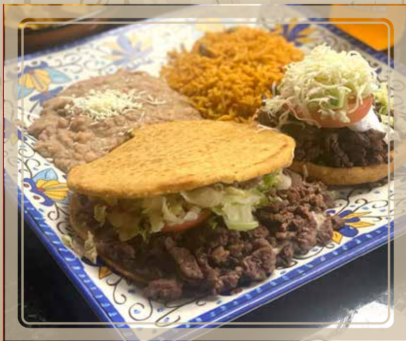
#76 Gordita, Sope Dinner

*Price may change due to choice of meat ordered.