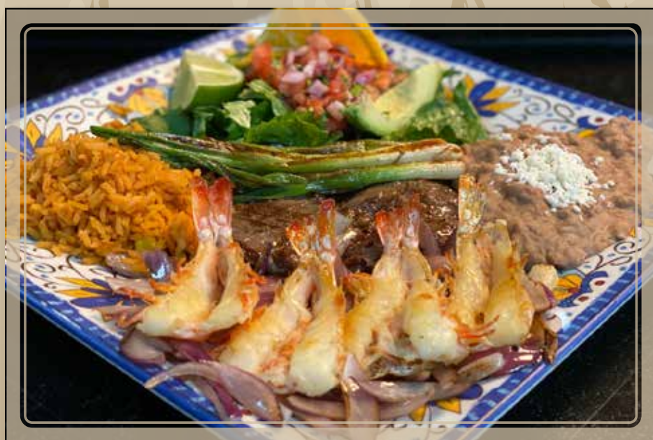
#16. Mar y Tierra

Carne asada, 4 camarones a la plancha y cebolla asada. / Skirt Steak, 4 jumbo shrimps on a bed of grilled onions.