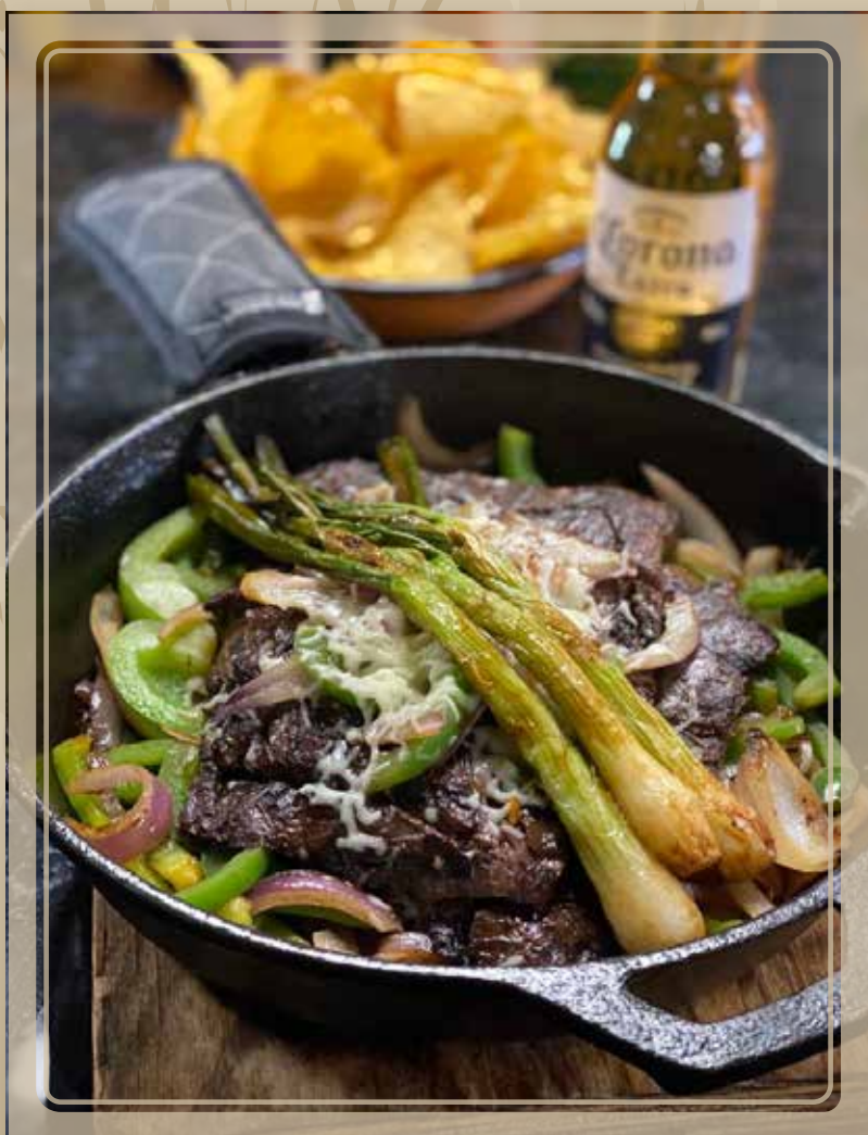
#11. Parrilla Zamora de Res

Una parrilla con cebolla y chile morron asado. Acompanado con cebollitas, queso, frijoles aztecas y 1 quesadilla. / Skillet served with grilled onions & bell peppers. Includes green onions, cheese, Azteca beans & 1 quesadilla.