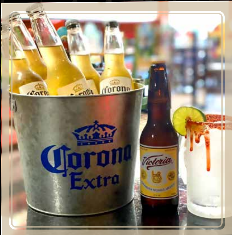
Cubeta / Victoria

Saturday & Sunday 2 hr limit from 9 am - 3 pm