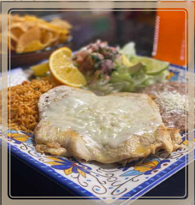
#31. Pechuga Suiza