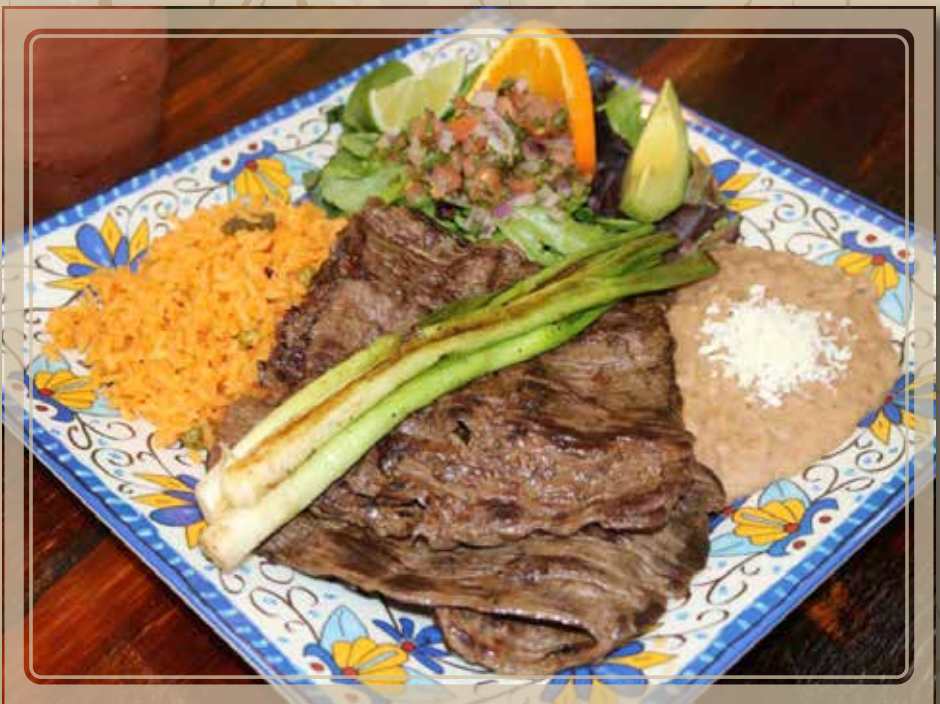
#1 Carne Asada

Ribeye steak chopped and mixed with grilled onions.