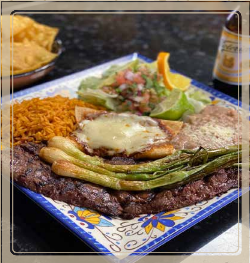
#8. Bistec a la Tampiqueña

Bistec en corte ancho servido con cebollitas, 2 enchiladas de queso en mole rojo. / Thick cut steak served with green onions and 2 red mole enchiladas.